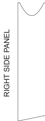
RIGHT SIDE PANEL